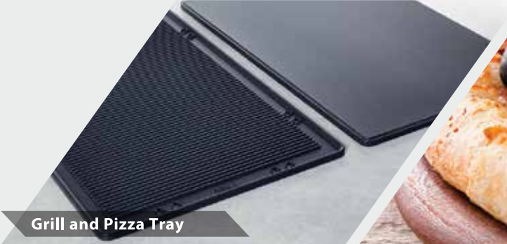
Grill and Pizza Tray