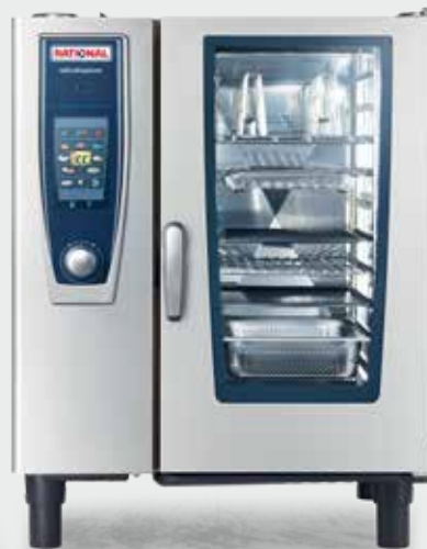
SelfCookingCenter® Model 101