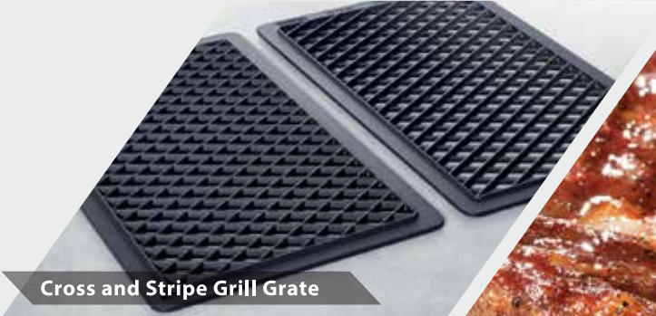
Cross and Stripe Grill Grate