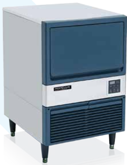
MDIU-60A / MDIU-100A / MDIU-150A