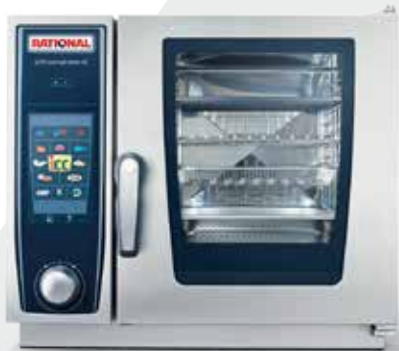
SelfCookingCenter® Model XS

The standard for Southeast Asian cuisine