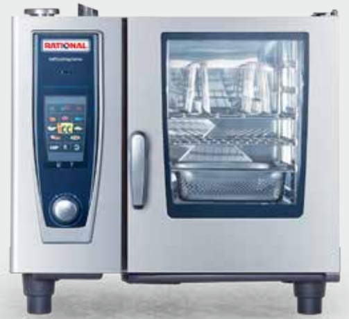
SelfCookingCenter® Model 61