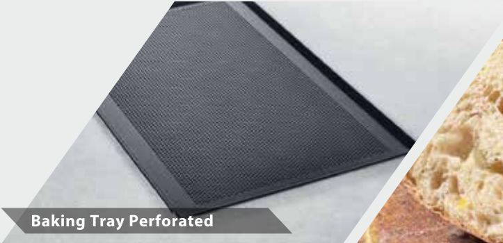
Baking Tray Perforated