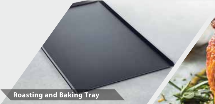
Roasting and Baking Tray